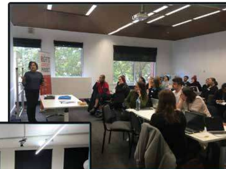
Left: The 2019-2020 Criminal Justice team present at RAP's May 2019 Project Pitch Night.