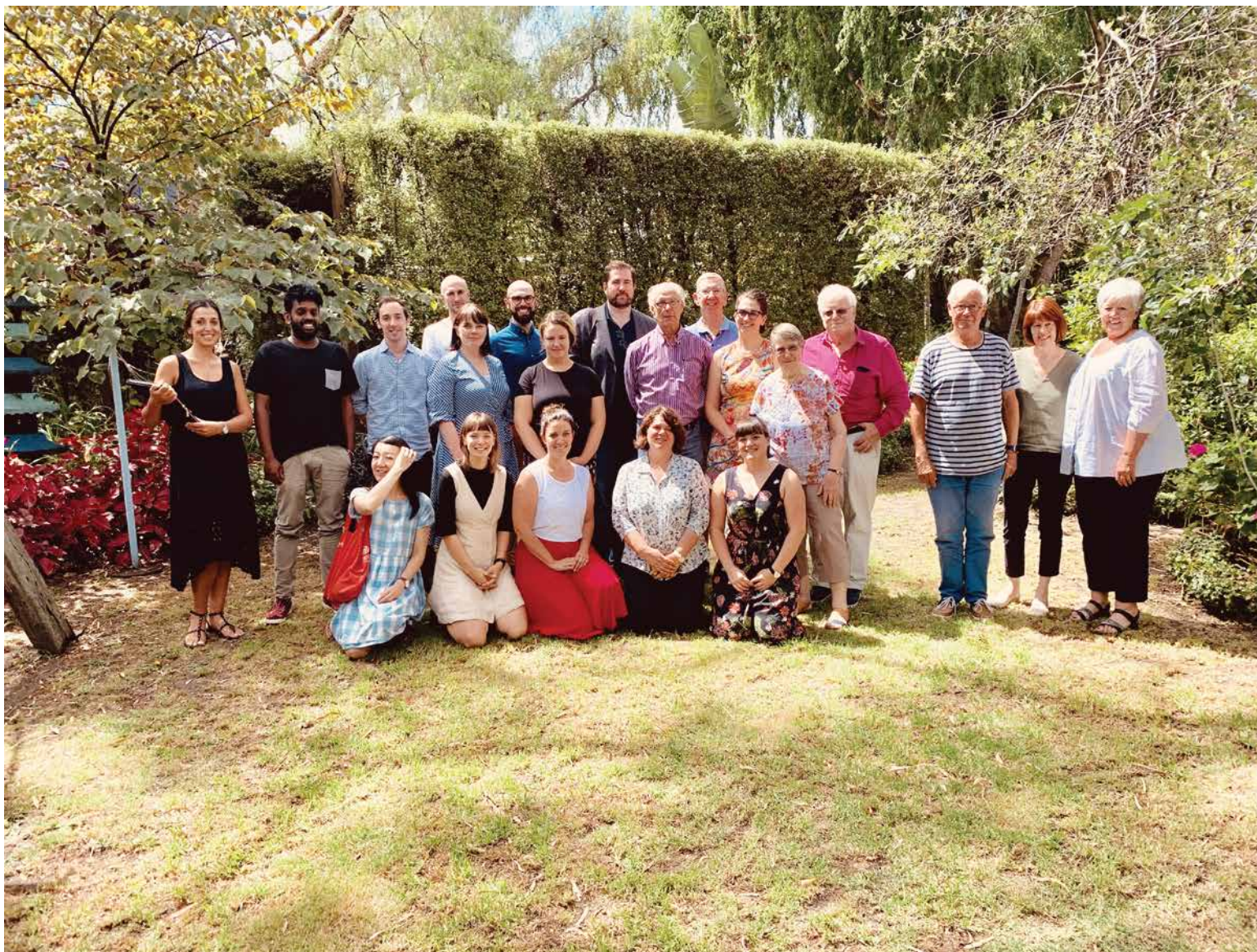
Photo: Committee Members - Strategic Planning Session February 2019