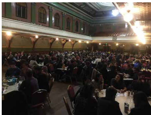
Below: RAP Trivia Night 2018